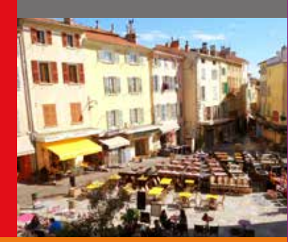
Hyères , France