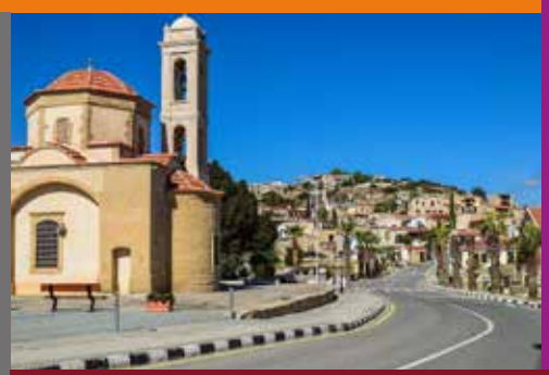
Psematismenos , Cyprus