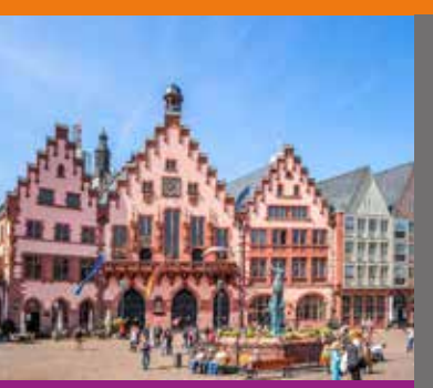
Frankfurt am Main, Germany